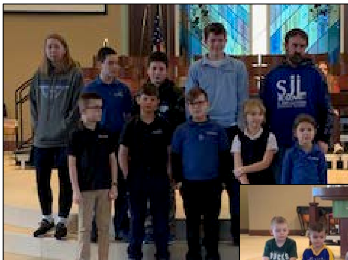
BAPTISM CELEBRATION February

Our theme reminds us of God's love on our good days and bad days, that He is faithful to His promises, and that our greatest joy is in Jesus, our Savior.